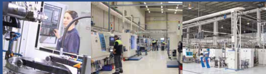
NKE Steyr, Austria