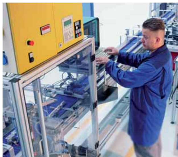
100% noise testing guarantees highest precision.