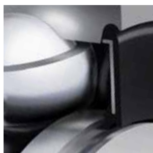
The newly developed NKE double-lip labyrinth seal